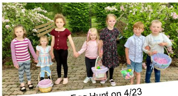
Easter Egg Hunt on 4/23