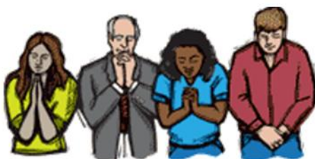
National Day of Prayer

O'Dowd, R. (2022, September, 18). What Does Proverbs 1:7 Mean?. www.crossway.org https://www.crossway.org/articles/what-does-proverbs-17-mean/